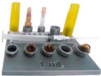
STEP 1: PREPARE

*** ROI is achieved by lowering costs associated with fatigue, injuries, and errors.