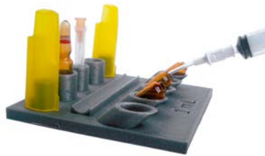
STEP 2: WITHDRAWAL