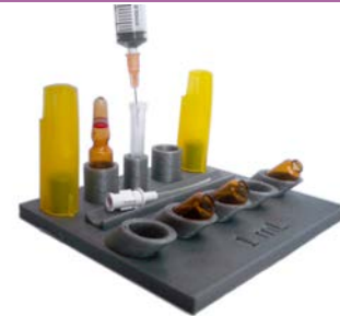
STEP 3: CHANGE NEEDLES